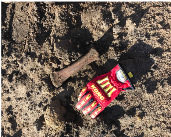
3. Bone found Km 96 and 625 – Sept 20, 2017