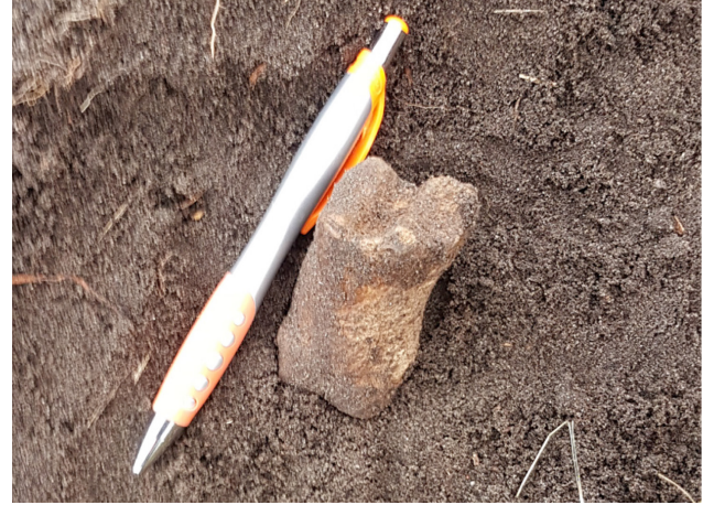
6. Bone found at Km 45 and 200 – Sept 22, 2017