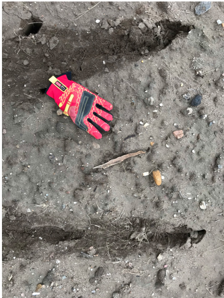
7. Bone found at Km 99 and 100 – Sept 22, 2017