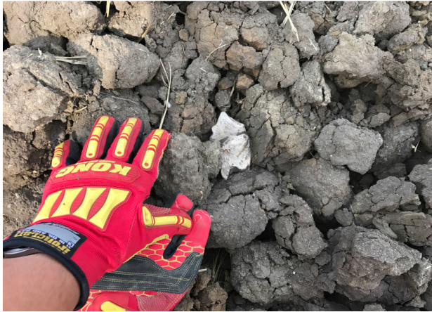
1. Bone found at 95km and 800 – Sept 18, 2017