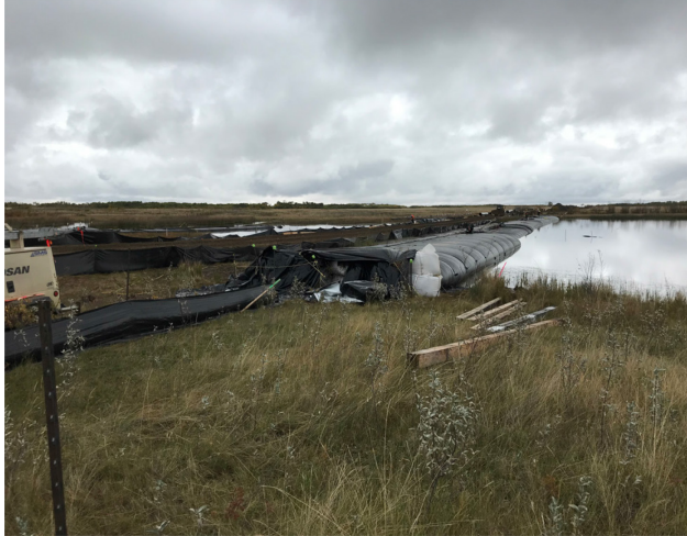
5. Water-crossing at 45km and 200 – Sept 22, 2017