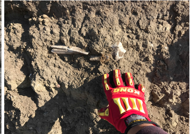
2. Bone found at 97km and 210 – Sept 20, 2017