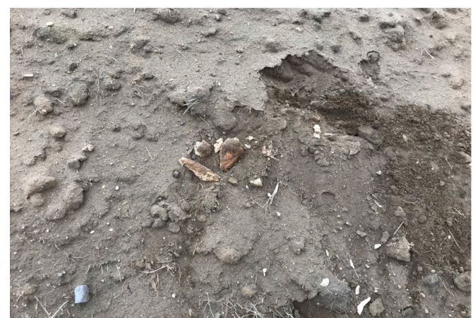
4. Bone found at 98km and 500 – Sept 22, 2017